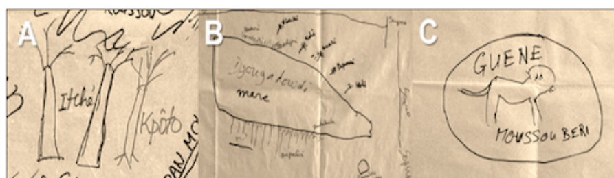
Figure 2 – Examples of icons which refer to symbolic, functional and jurisdictional knowledge (F. Burini, 2010).

In this way semantics are produced which favour a perspective view and the use of symbols which are mainly figurative, and to which the toponyms transcribed in the local language are associated. These are icons that refer to knowledge which is symbolic, which give to the land socially recognisable values such as history and myth (sacred sites, places of foundation) or performative and carry a wealth of knowledge that can be divided into three categories: functional knowledge, aimed at intellectual knowledge and material practices for the identification of locations in which productive activities take place (agricultural and pastoral areas, hunting and fishing grounds and areas which are harvested); jurisdictional knowledge which give information regarding the social and territorial organisation of the local community (village boundaries, position of land, political and religious authorities); and security knowledge, aimed at optimising the use of resources and at guaranteeing their reproducibility (rested agricultural areas, unused forests) [18].